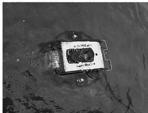
Fig. 3(left) Multi beam sonar (SeaBat 8125) equipped with boat. (Y. Matsumoto)