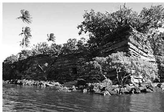
Fig. 1 Artificial islets of Nan Madol.

The UNESCO Office for the Pacific Region (Apia, Samoa), acknowledging that international support is needed to protect and inscribe the site on the World Heritage List, approached the Japan Consortium for International Cooperation in Cultural